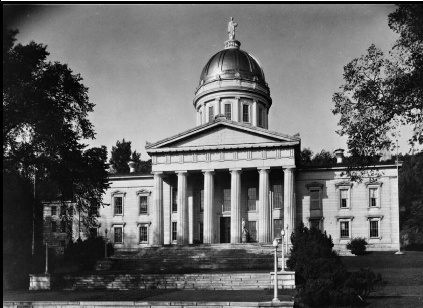
Vermont State House.