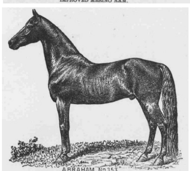
The Bennington Banner, issue 20 Aug. 1891 (Supplement), p. 5.