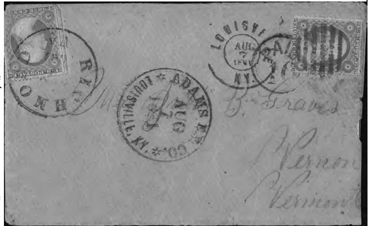
Figure 1 (1861) envelope from Liggon's tobacco warehouse in Richmond, Virginia via Louisville, Kentucky to Vernon, Vermont