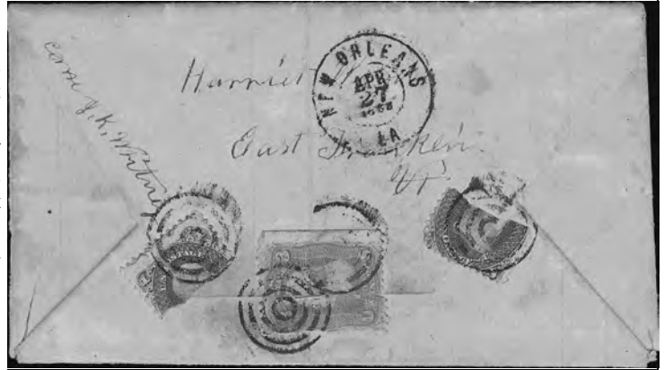
Figure 3 (1863) homemade envelope sealed with stamps from New Orleans, Louisiana to East Franklin, Vermont

Harriet Wood of East Franklin received a homemade envelope and letter that was sealed with postage stamps and postmarked in New Orleans, Louisiana on 27 April, 1863.[Figure 3] Harriet (apparently Mrs. Xenophon) Wood is in Franklin in the 1860 U.S. census. [11] Xenophon Wood served as a corporal and later sergeant with the 8th Vermont Infantry, and this regiment was in Louisiana in April 1863. [12] The enclosed letter speaks of a recent battle where “the Rebs admit a loss on their side of 50 men killed 200 wounded and 500 prisoners and 4 gun boats.” [13] Xenophon Wood survived the war and lived until 1900. [14]