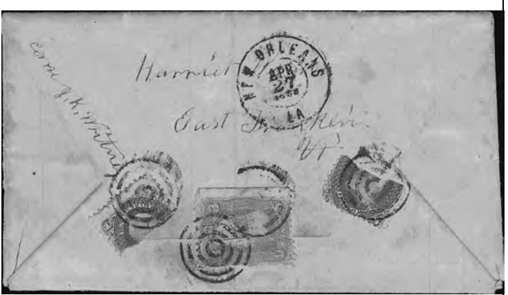
Figure 3 (1863) homemade envelope sealed with stamps from New Orleans, Louisiana to East Franklin, Vermont (Photo courtesy of Robert A. Siegel Auction Galleries, Sale 980, Lot 2441)

To be Continued in the September 2015 GSV Newsletter